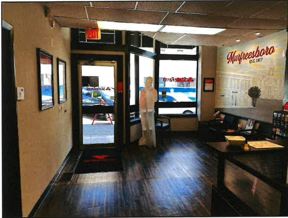
Interior of 123 N. Maple Street