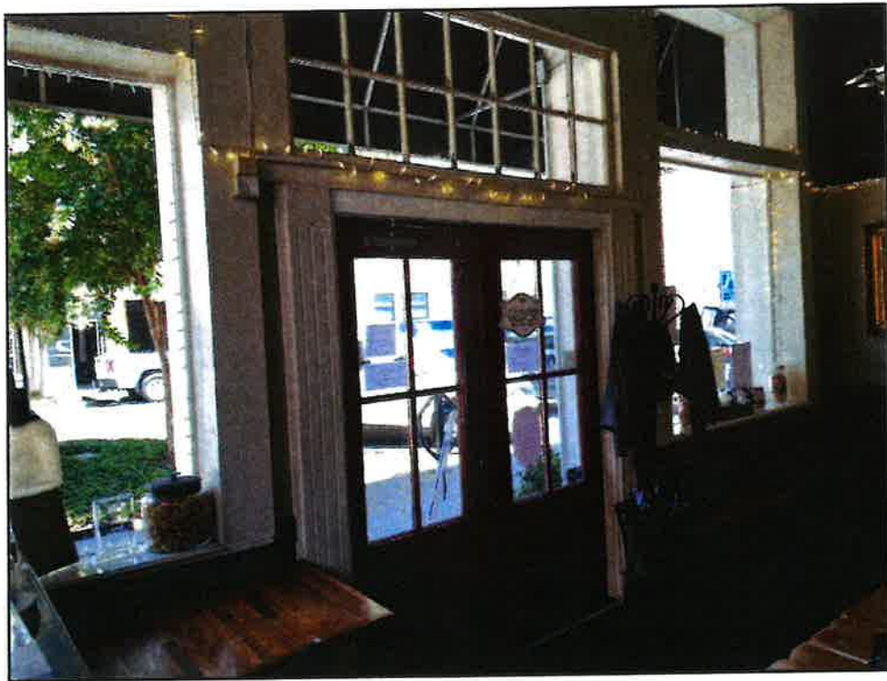
Interior of 125 N. Maple Street