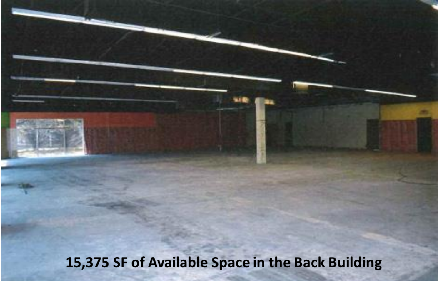
15,375 SF of Available Space in the Back Building