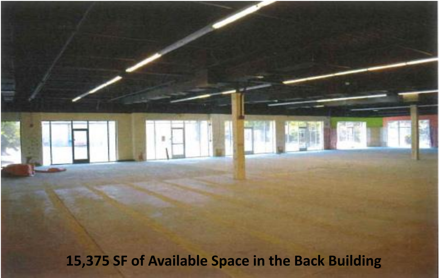
15,375 SF of Available Space in the Back Building