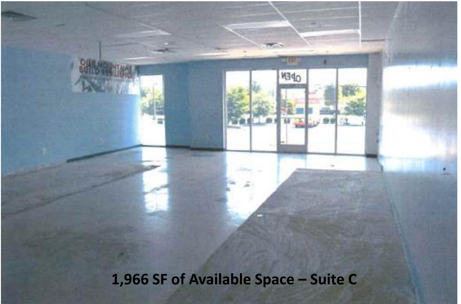
1,966 SF of Available Space – Suite C