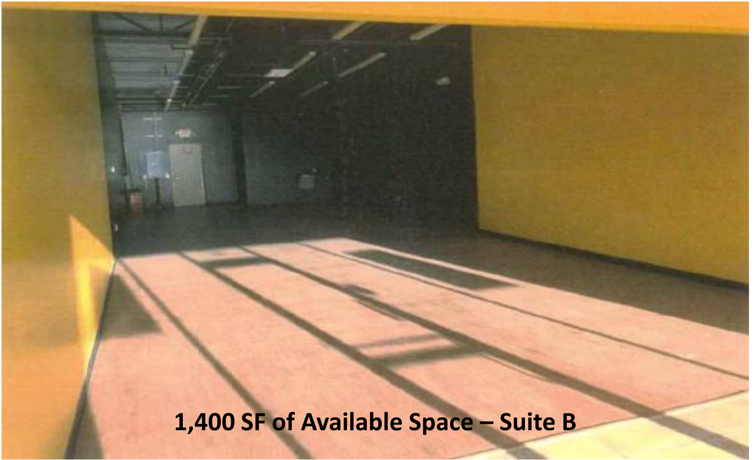
1,400 SF of Available Space – Suite B