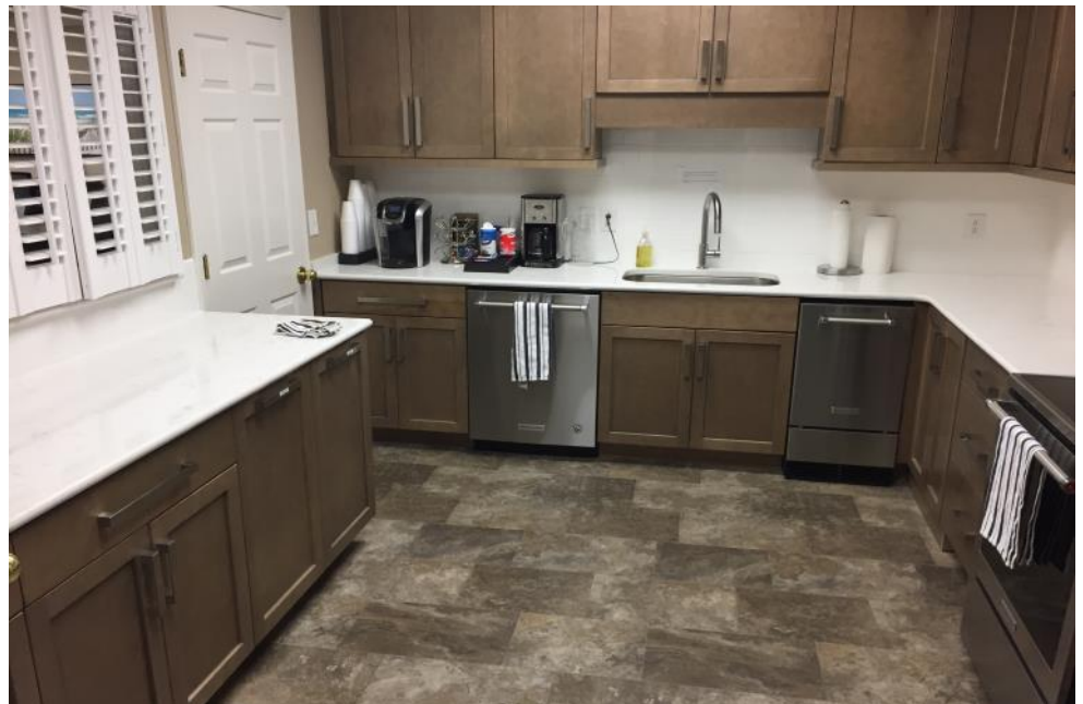
Newly Renovated Full Kitchen