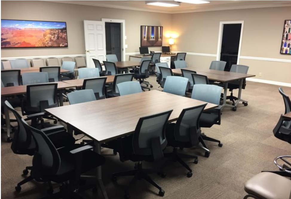
Newly Renovated Conference Room